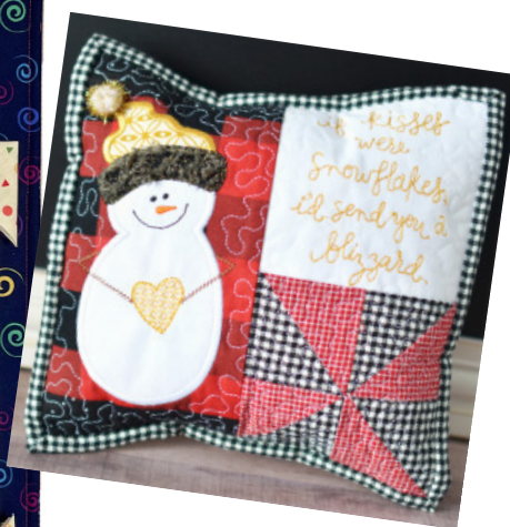
Machine Embroidered Option