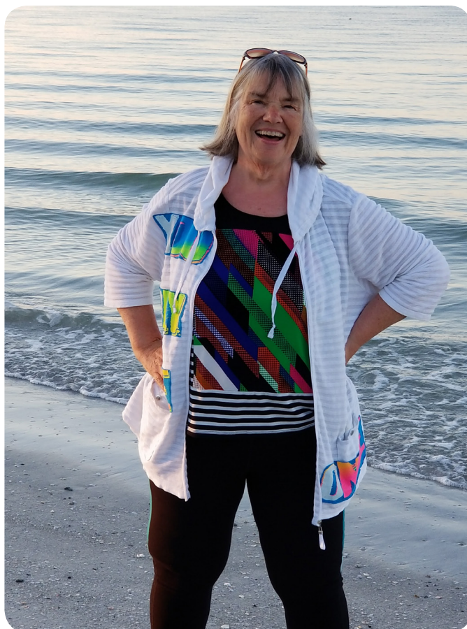
Madiera Beach, Florida