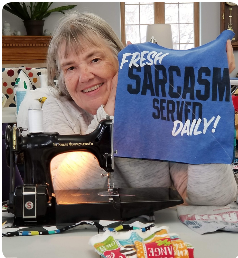
S.E.W. Retreat 2018