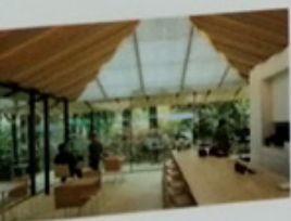
sign of the Umami Café

place at the crest of the hill. As with the this structure